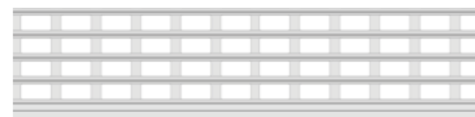
Even design arrangement