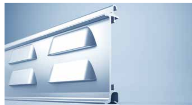
Ventilation profile for clockwise and counterclockwise rollers