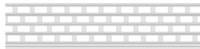
Offset design arrangement