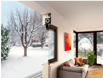
[Querschnitt heroal IB Unique + heroal W 77]

Thanks to different box sizes, inspection panel types and integration options for different shading systems, heroal IB Unique offers planners and fabricators a wide range of design options.