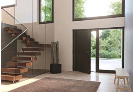
[heroal_Architektenhaus_Le Corbusier_Haustür_Milieu innen]

Due to the exclusive partnership with Les Couleurs® Le Corbusier, heroal offers the high-quality colour spectrum for window, door, curtain wall, roller shutter, roller door and sun protection systems.