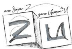
[heroal IB Unique Super-Z-Falteinmontage-Technologie]

Due to the special super-Z-folding installation technology, the heroal IB Unique can be shipped and stored in a space-saving way and offers increased stability for further manufacture.