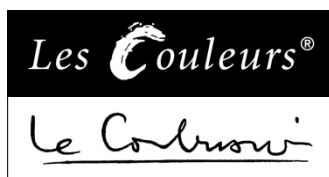
[Logo Le Corbusier]

Charles-Édouard Jeanneret-Gris, alias Le Corbusier (1887-1965), developed two colour collections in 1931 and 1959 – known as Architectural Polychromy. This architectural colour system has a timeless aesthetic and each of the 63 colours can be harmoniously combined.