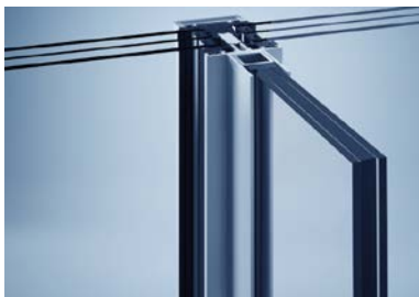
[heroal C 50 GD]