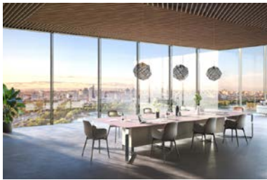
[heroal C 50 GD Milieu]

The innovative heroal C 50 GD curtain wall system creates maximum transparency thanks to the glass fin.